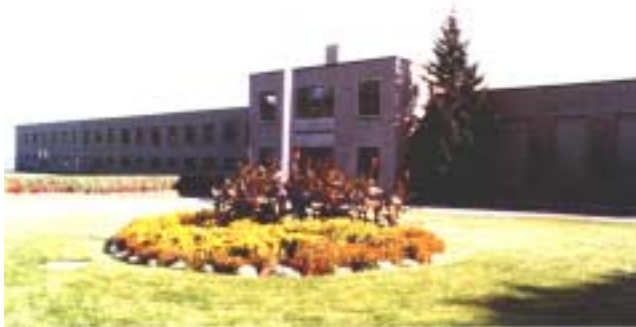
Water Treatment Plant 302 King St. West. Kingston, On. K7L-2X1 phone: 613-546-1181 ext. 2296 fax: 613-542-7096

testing is carried out on raw water, mid process, treated water and distribution samples on a daily basis. On-line analyzers for chlorine residuals and turbidity ensure safe, clear water leaving the plant. Chlorine levels in the distribution system are checked daily. More specialized testing occurs monthly and quarterly, and includes parameters such as pesticides, heavy metals, disinfection by-products, volatiles and organics.